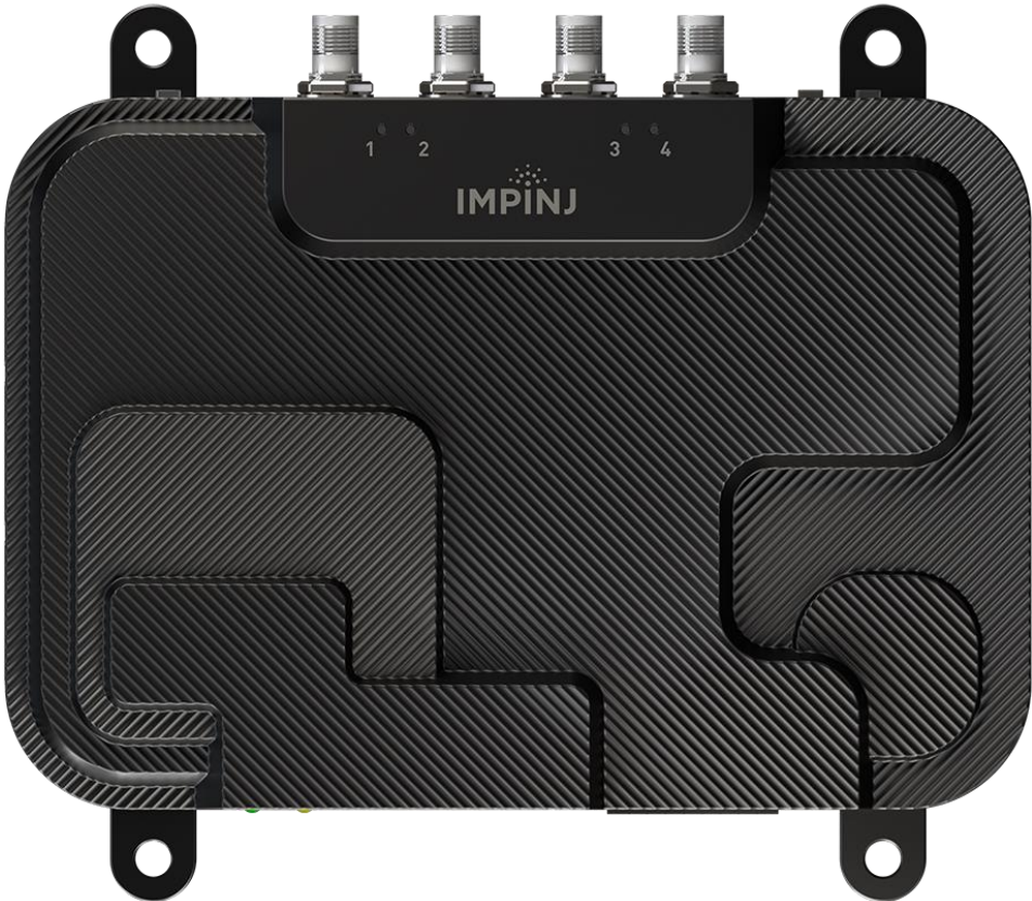
Figure 2: Impinj R700/R720 Bottom View